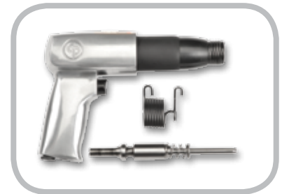
Air Powered Rivet Driver

*Includes Air Powered Rivet Driver, Retaining Spring, and Drive Rod with Hold Down Spring and Washer.