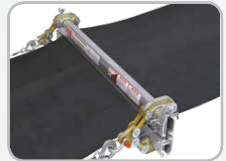
Far-Pul® HD® Belt Clamp