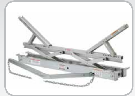
Flex-Lifter™ Belt Lifter