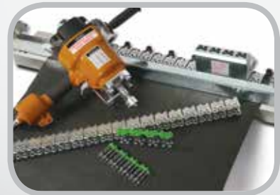
Select installation method