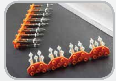
Rapid Loader™ Collated Rivet Strips with washers