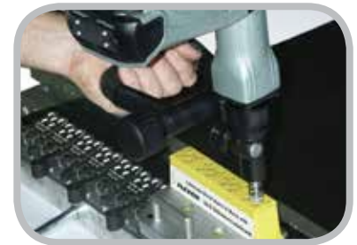
Electric Powered Rivet Driver Installation