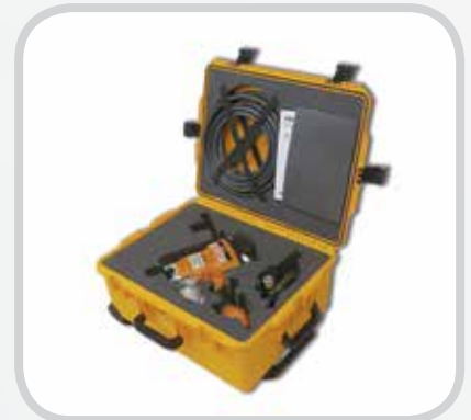
The Pneumatic Single Rivet Driver is protected by a portable carrying case