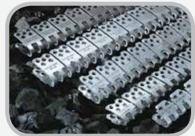
Select fastener size