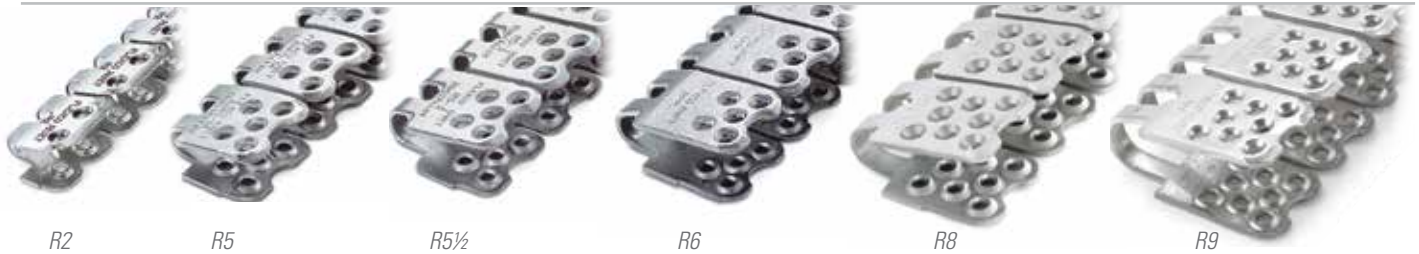
Flexco® Rivet Hinged Fastener Selection Chart

Use the charts below to match the Flexco® SR™ fastener to your needs. Find the fastener metal type required for your application. Then choose the ordering number that corresponds to your belt's width from the charts on the following pages.