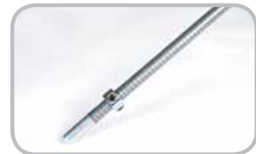
Hinge Pin Retaining Collar