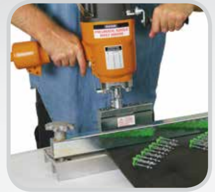
Consistent, long-lasting splice every time