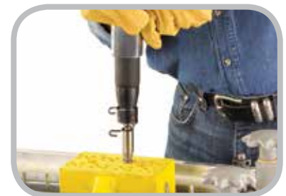
Air Powered Rivet Driver Installation

The heavy-duty tool allows for more compression of fastener plates resulting in a smooth and consistent splice that is compatible with conveyor components.