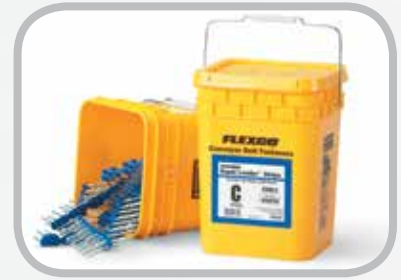
Conveniently packed, easy-to-use