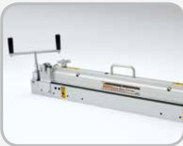
900 Series* Belt Cutter