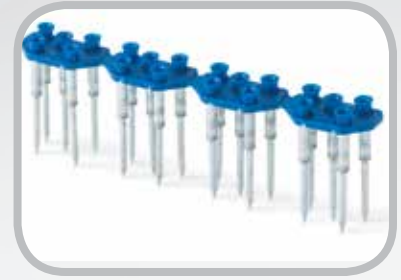
Rapid Loader™ Collated Rivet Strips