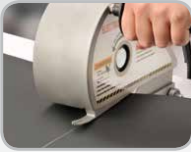
Electric Belt Cutter