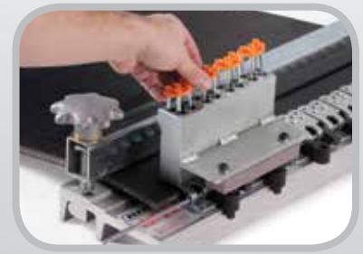
Speed Installation Time