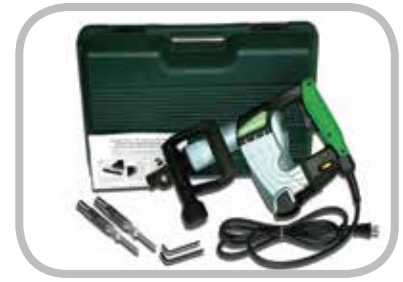
Electric Powered Rivet Driver

*Kit includes Driver, two Custom Drive Rods, Convenient Carrying Case.