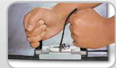
Flexco® Belt Groover