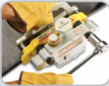
FSK™ Belt Skiver