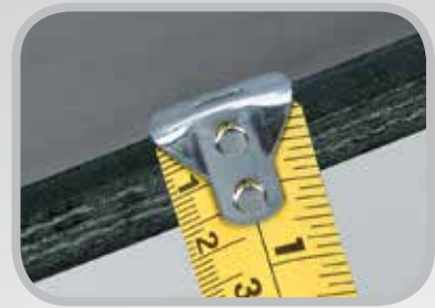
Measure belt thickness